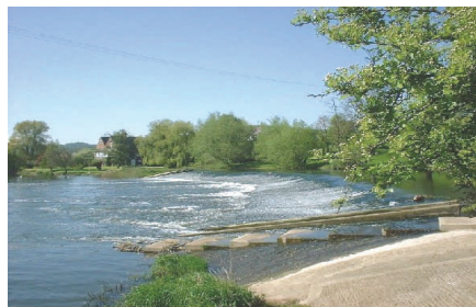
Help maintain your local area to keep it looking as beautiful as this.